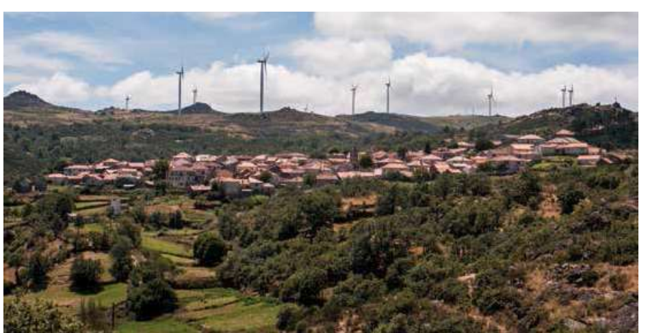
General view of the village of Gralheira (Cinfães) from the village of Panchorra (Resende).

Gralheira's current limits, which are heirs, if not a copy, of the division that took place in 1258, may shed light on the approximate location of that ancient path<sup>7</sup>. The fact that its importance and antiquity (no matter how vague and subjective this qualification is) would be enough to trigger the idea of that this was a georeferencing structure in the minds of the mountain inhabitants of the time, seems rather clear. However, the expression "path" is not necessarily associated with a road with an especially heavy traffic. Most likely, it was one of the first regional crossings that were later replaced by the more or less complex network that accompanied the clearing of land and the humanization of the mountain.