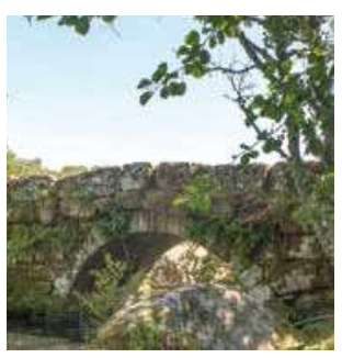
Downstream view. Detail.