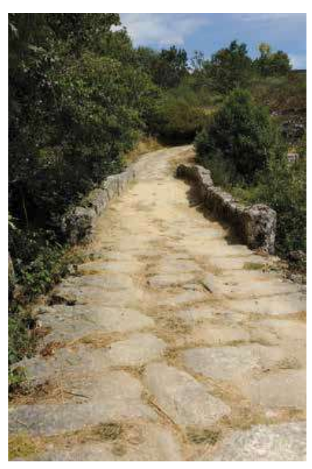
Stone path leading to the Bridge.