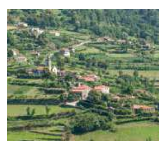
Partial view of the village of Ovadas (Resende).