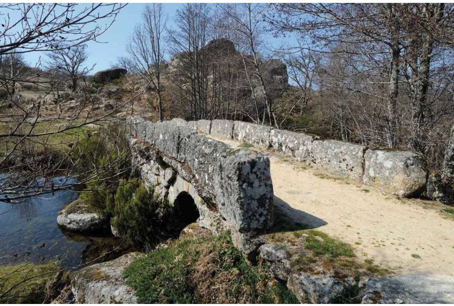
Platform and guards

The source of the Cabrum river or brook, as it is often called, is located in Casa das Neves, near Gralheira and flows into the Douro river at the hamlet of Lampreeira, which is currently submerged due to the reservoir created by the Carrapatelo dam. The parish priests from 1758 give us some information about its flow, fish fauna, and fisheries and, of course, about its crossings.