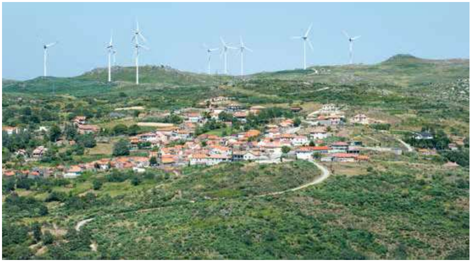
General view of the village of Panchorra (Resende) from the village of Gralheira (Cinfães).

In the 16<sup>th</sup> century, Panchorra became ecclesiastically independent from Ovadas, but was still a small village. In 1527, it had 17 residents, i.e., between 71 and 77 inhabitants (Collaço, 1931: 145). Its status as a chaplaincy or curacy confirms the connection to Ovadas which remained connected to Panchorra due to the patronage right. It is only natural that, in addition to the creation of the new parish, the main acts of the Christian life continued to take place in the valley, in the church of Saint Pelagius, the area's primary core of humanization and Christianization<sup>6</sup>.