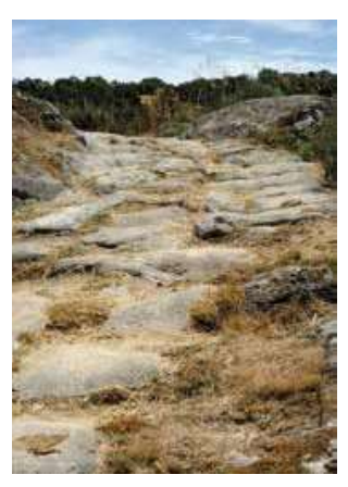
Stone path leading to the Bridge.